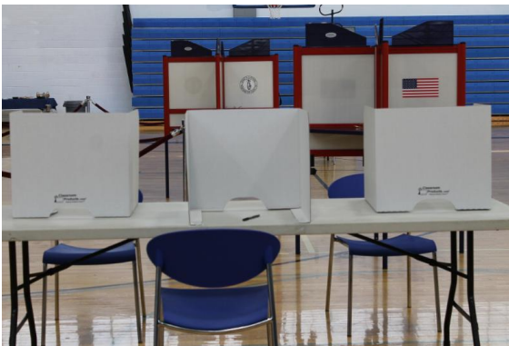
Budget Vote/Trustee Election May 16, 2017 7am-9pm, HS Gymnasium