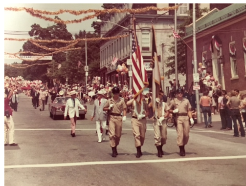
Memorial Day May 29, 2017 Schools Closed