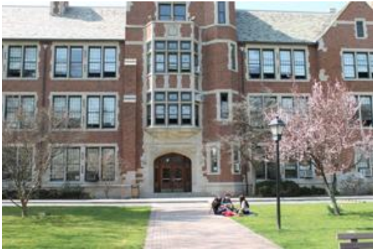
Spring Recess April 10-17, 2017 Schools Closed