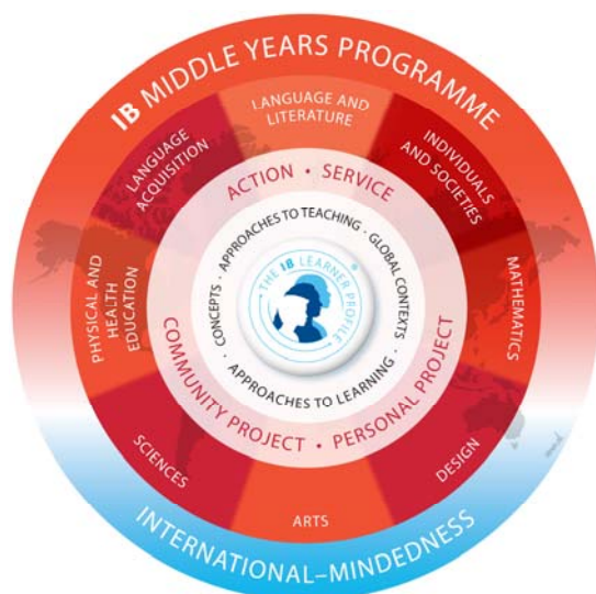
Grades 9 and 10

Students have two choices when considering the IB Diploma Program offered at Dobbs Ferry High School. Students can pursue the full IB Diploma or they can choose to take individual IB courses in any of the six groups. Students who pursue the full IB Diploma understand that it is a comprehensive, two-year, pre-university course of study beginning in eleventh grade. The coursework is rigorous, intellectually stimulating, and leads to examinations in which students must demonstrate critical understanding of subject matter. IB courses are open to all students. The IB course of study is the most rigorous program offered at Dobbs Ferry High School and it is designed so that all students may participate.