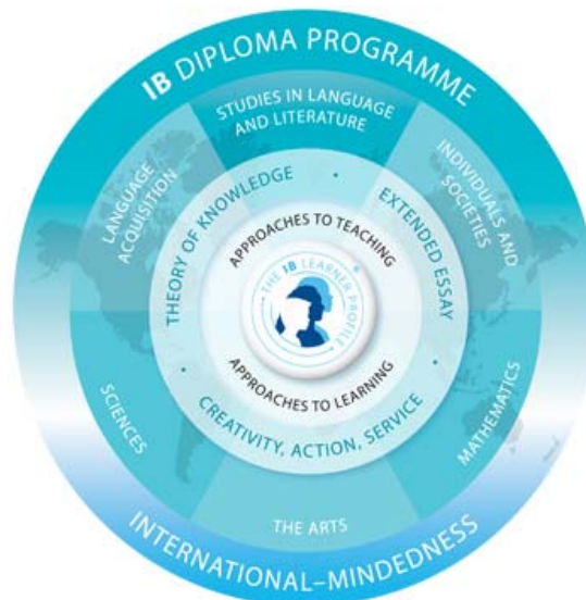
Grades 11 and 12