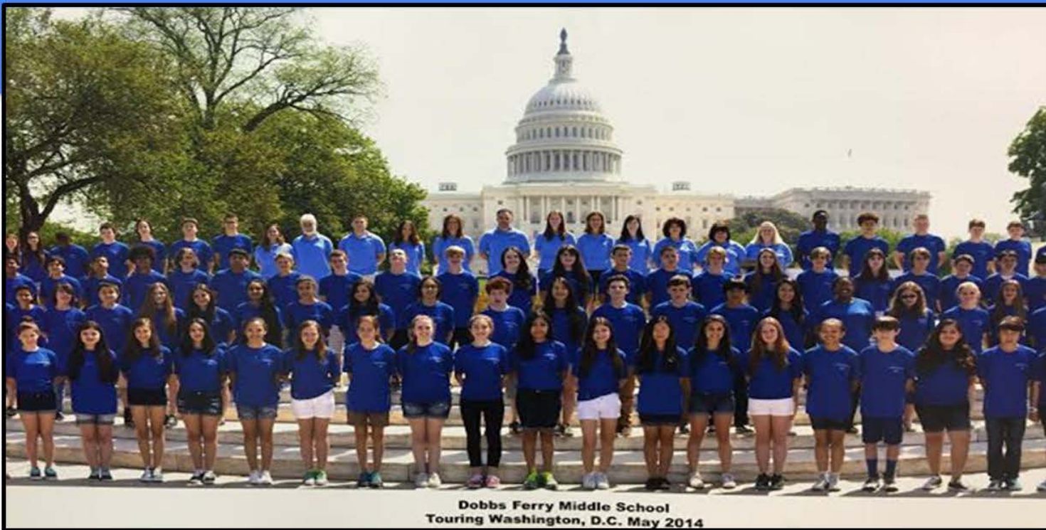
Dobbs Ferry Middle School Touring Washington, D.C. May 2014