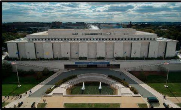
Museum of American History