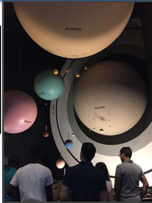
Air and Space Museum