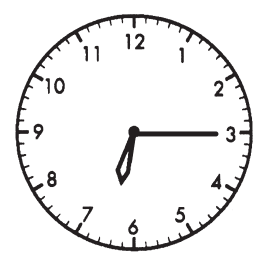
The time is not 3:30. It is after 6:00.